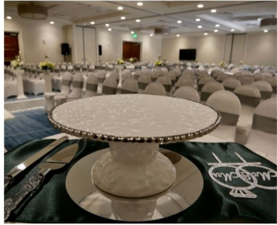
Full Banquet Room