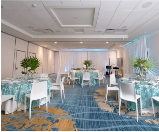
HALF BANQUET ROOM