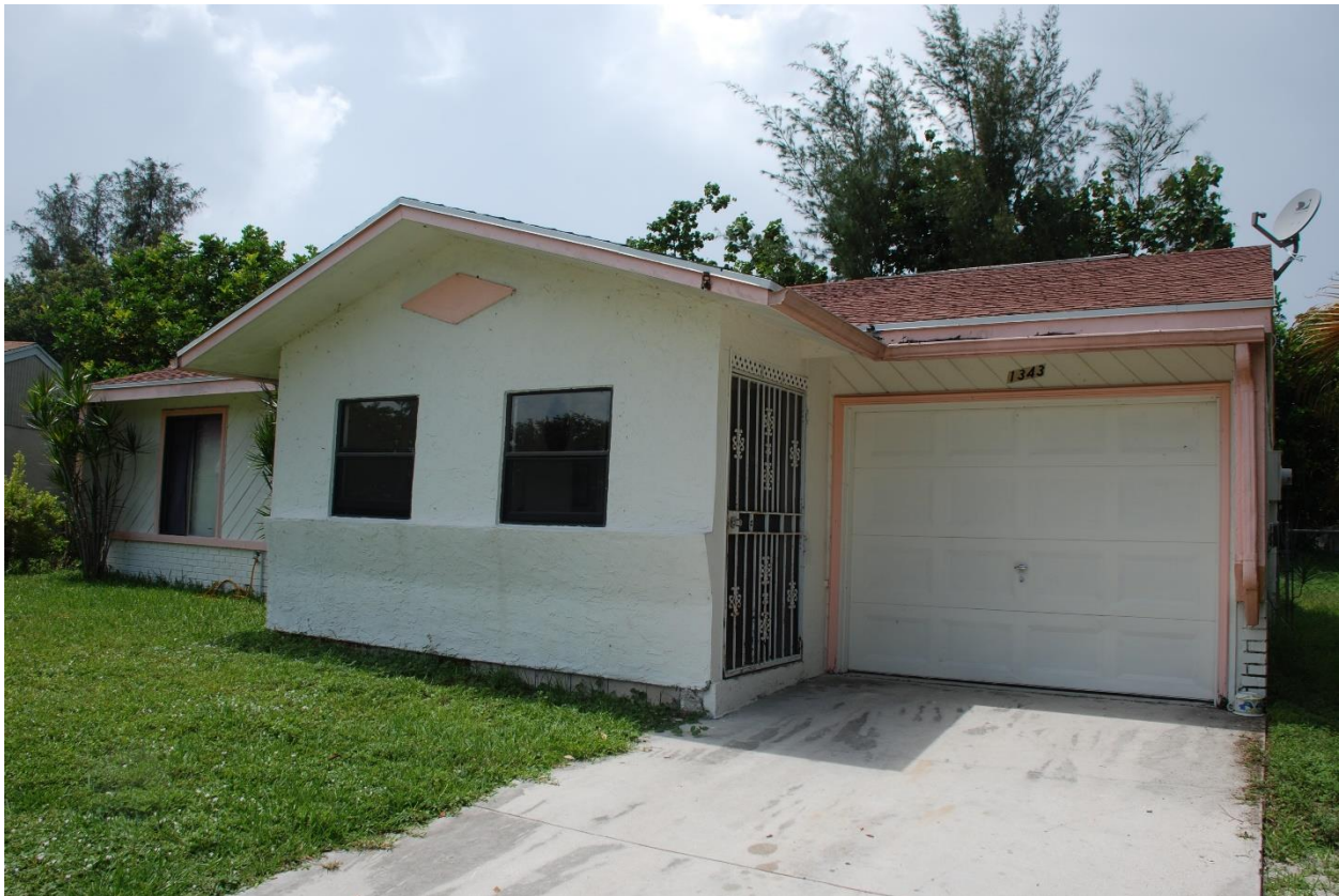
Illustration of the enclosed front patio.

Initiator: Village Manager Agenda Date Village Council P & Z Director Denial 02-20-2020 Action