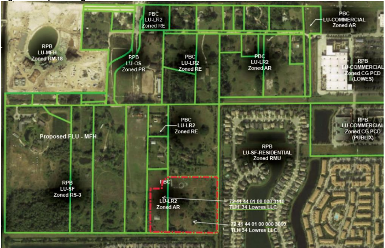
Figure 1: Map showing the location of Pod 8