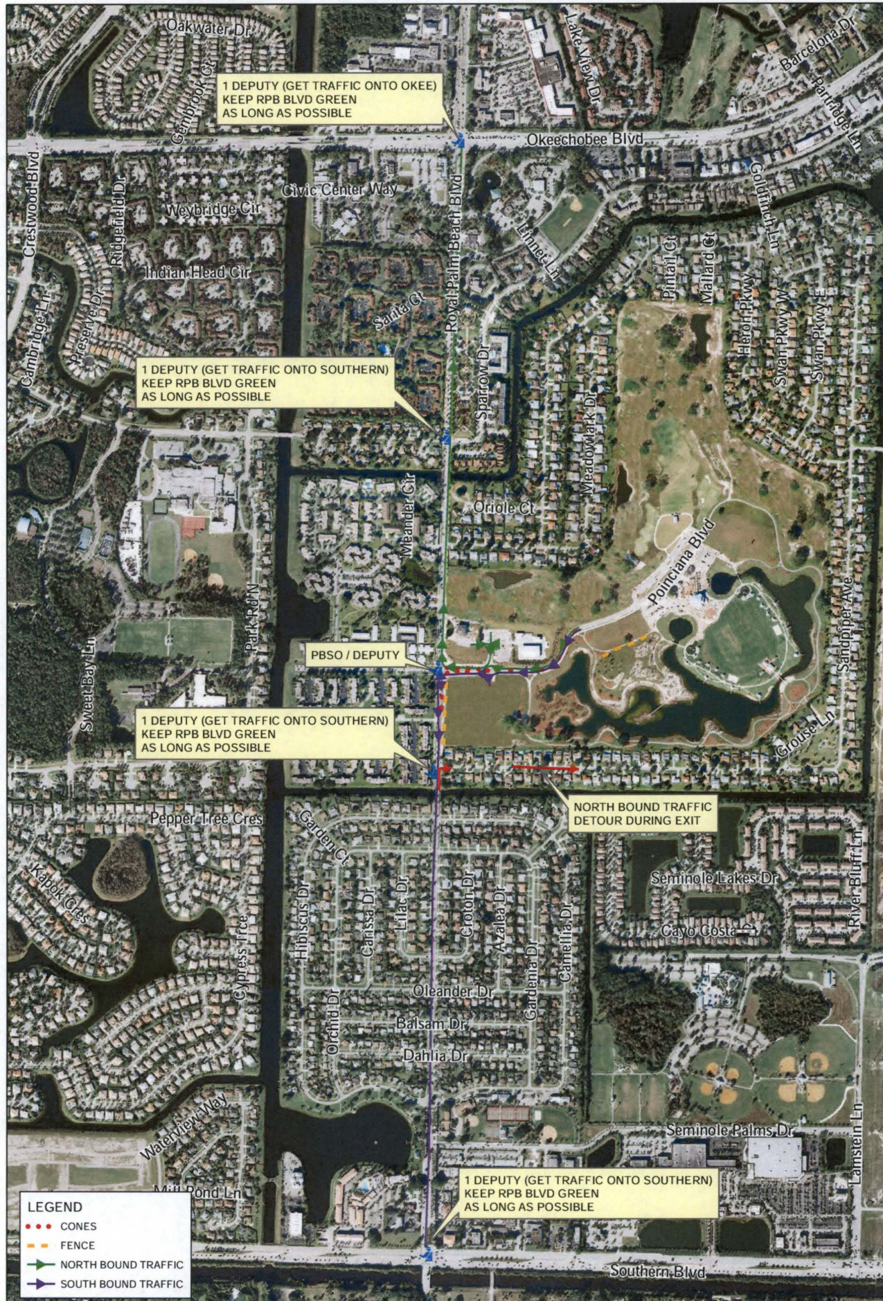
RPB COMMONS- EVENT EXIT PLAN B (OFFSITE)