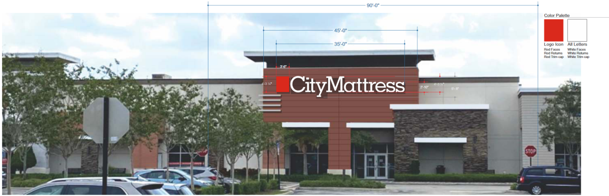
Option 2 Elevation: Modified Code Application

The illustration below depicts the proposed sign and location that is subject to this variance request.