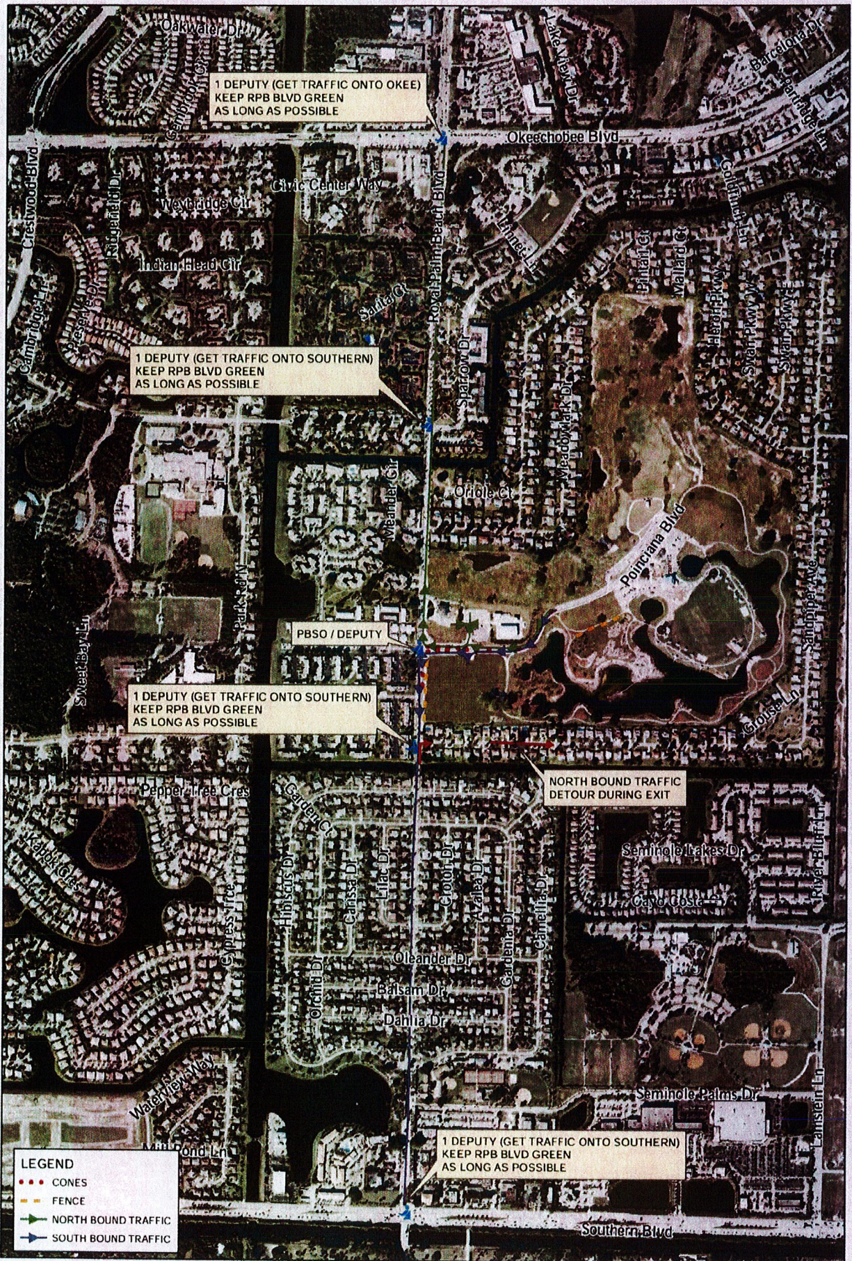
RPB COMMONS- EVENT EXIT PLAN B (OFFSITE)