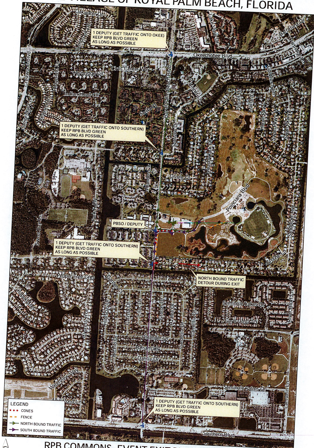
RPB COMMONS- EVENT EXIT PLAN B (OFFSITE)