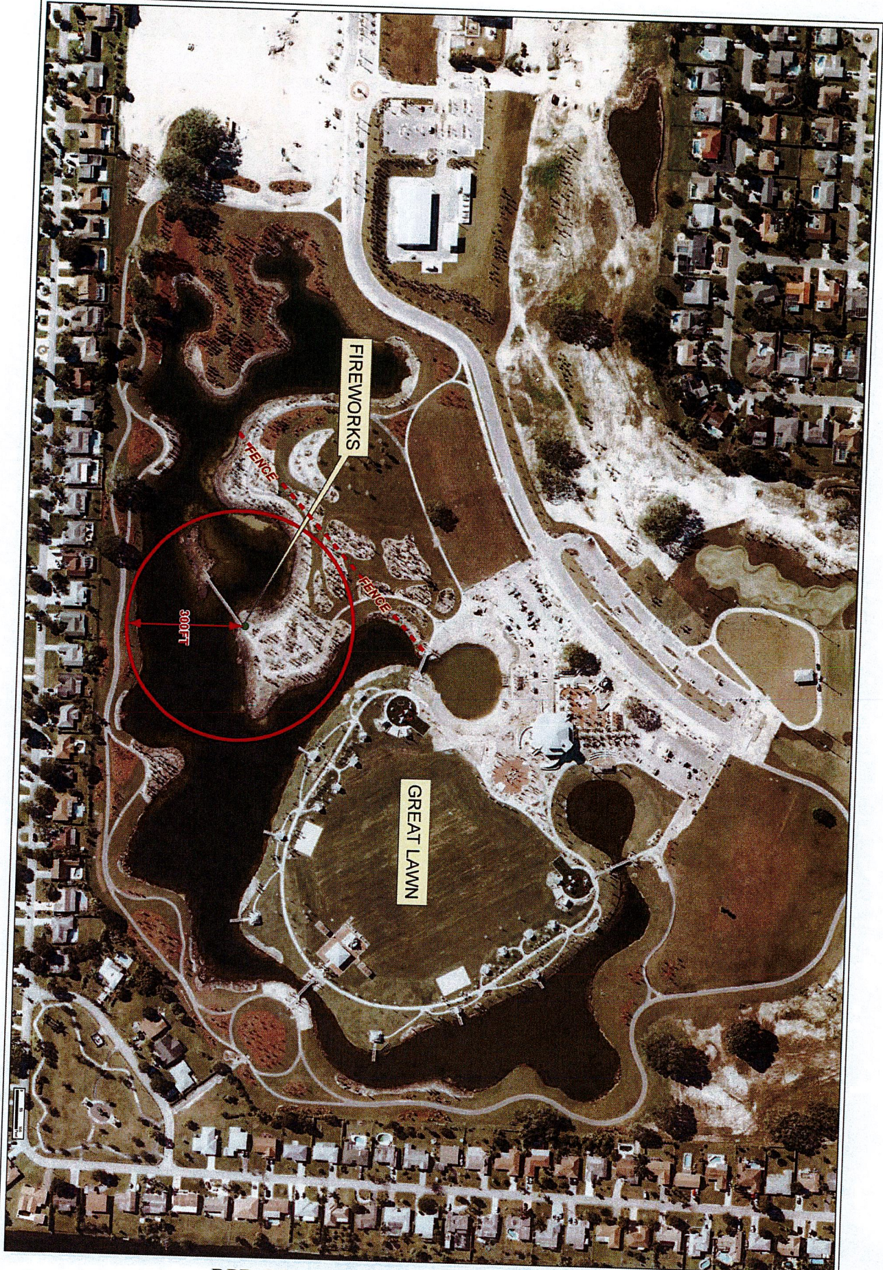
RPB COMMONS- JULY 4TH (PROPOSED) THE VILLAGE OF ROYAL PALM BEACH, FLORIDA