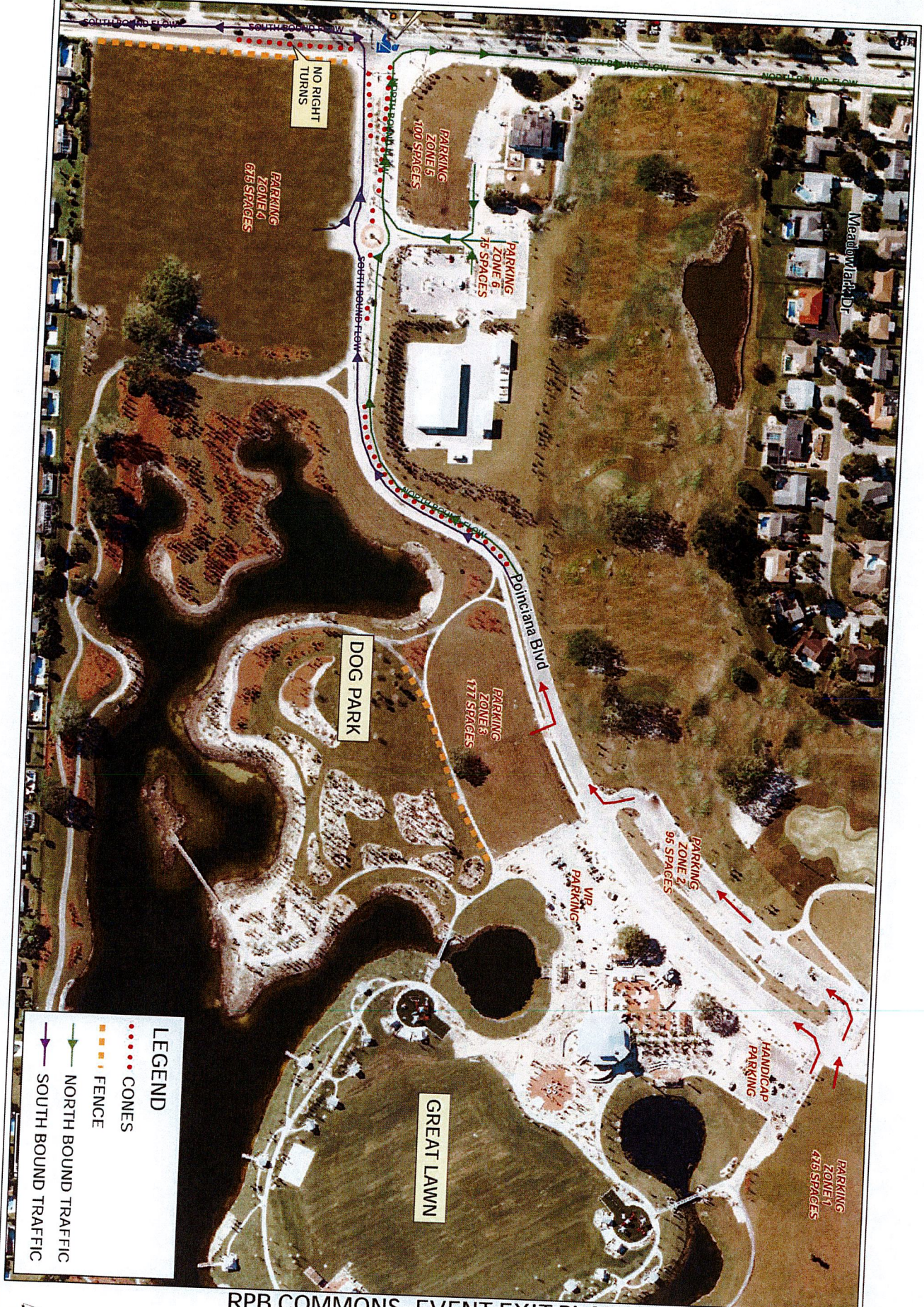
RPB COMMONS- EVENT EXIT PLAN B THE VILLAGE OF ROYAL PALM BEACH, FLORIDA