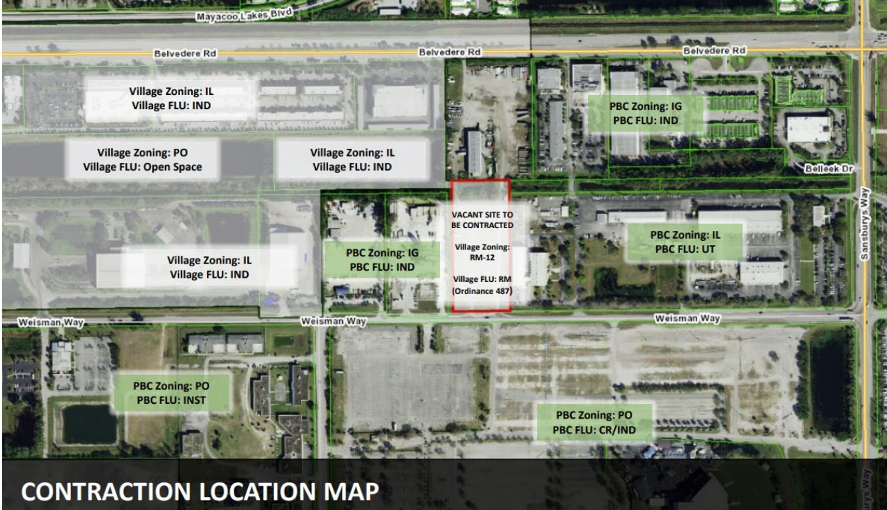
EXHIBIT "B" MAP OF DE-ANNEXATION AREA