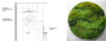
Main Lobby Int Elevation at GreenWall