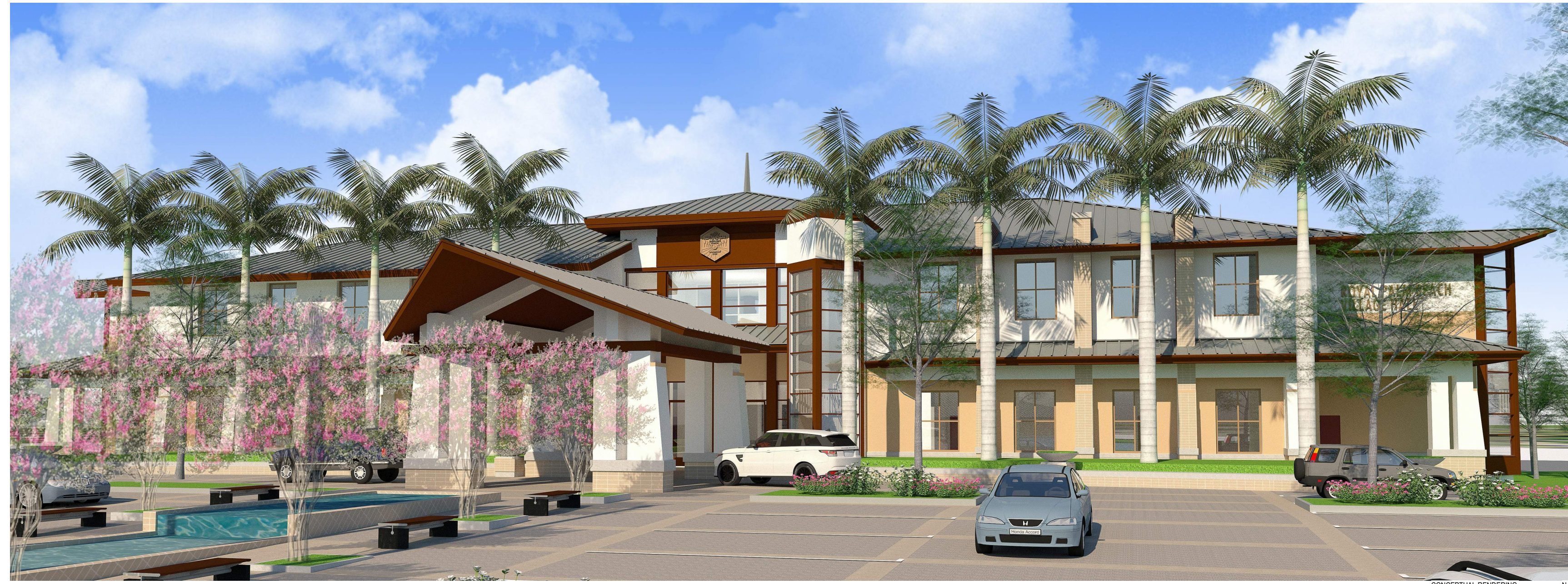
CONCEPTUAL RENDERING N.T.S.