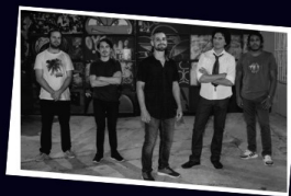
THIRTY HERTZ Classic Rock, Pop, & Reggae January 12