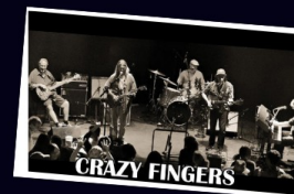
CRAZY FINGERS Grateful Dead Tribute January 19