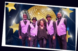
N2NATION R&B Band January 5