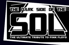
DARK SIDE OF THE SOL Pink Floyd Tribute April 19

FOR MORE INFORMATION PLEASE CALL 561-790-5140 OR VISIT WWW.ROYALPALMBEACHFL.GOV