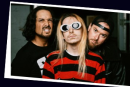
NIRVANNA Nirvana Tribute March 1