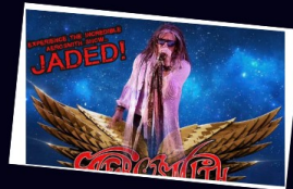
JADED Aerosmith Tribute April 5